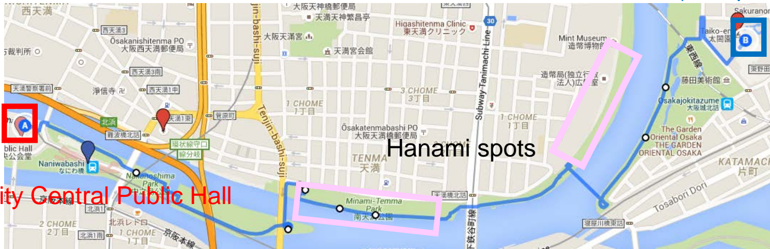
Osaka City Central Public Hall