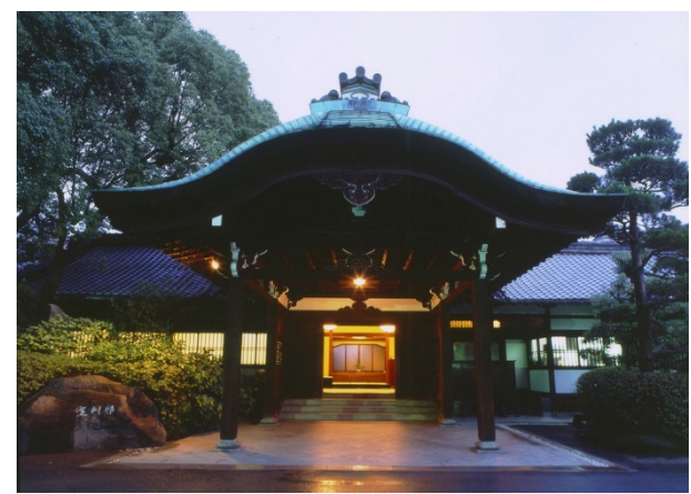
Taiko-en (Banquet place)